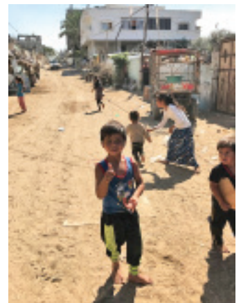
The online campaign supported Ahli Hospital's Community Clinic