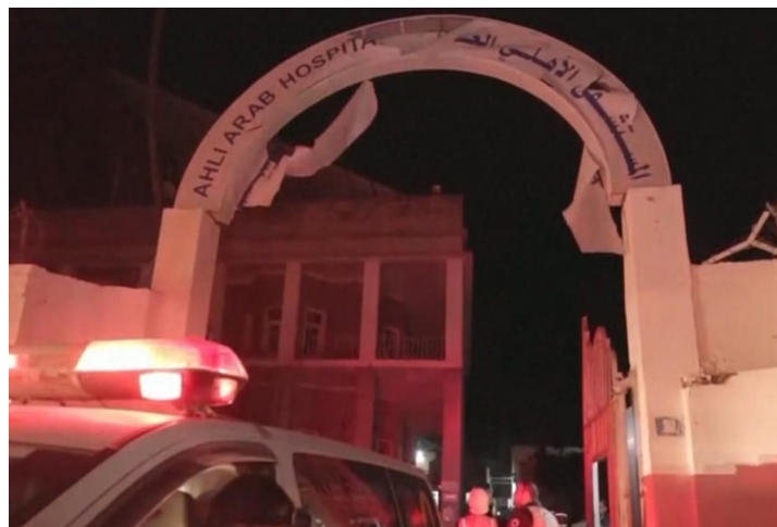
Ahli Arab Hospital after the October 17 blast

The attack that claimed so many civilian lives occurred on the same day that Archbishop Hosam Naoum, along with the Patriarchs and Heads of 13 Churches, had set apart as a day of global fasting and prayer for peace and