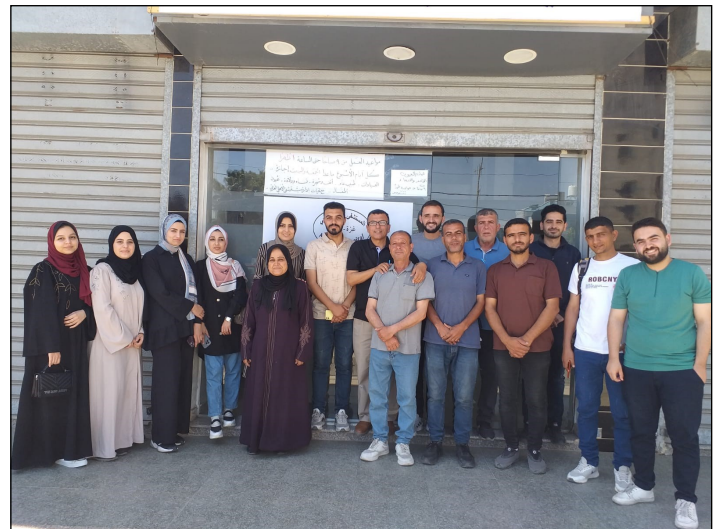
The spirit of Ahli Arab Hospital extends beyond its Gaza City walls: The dedicated Ahli team pose for a photo outside the newly-established Ahli outreach clinic in Rafah.

The Ahli Outreach Clinic in Rafah is an inspiring reminder that the care and compassion delivered by Ahli's remarkable medical staff is not confined to the walls of the hospital in Gaza City. We invite