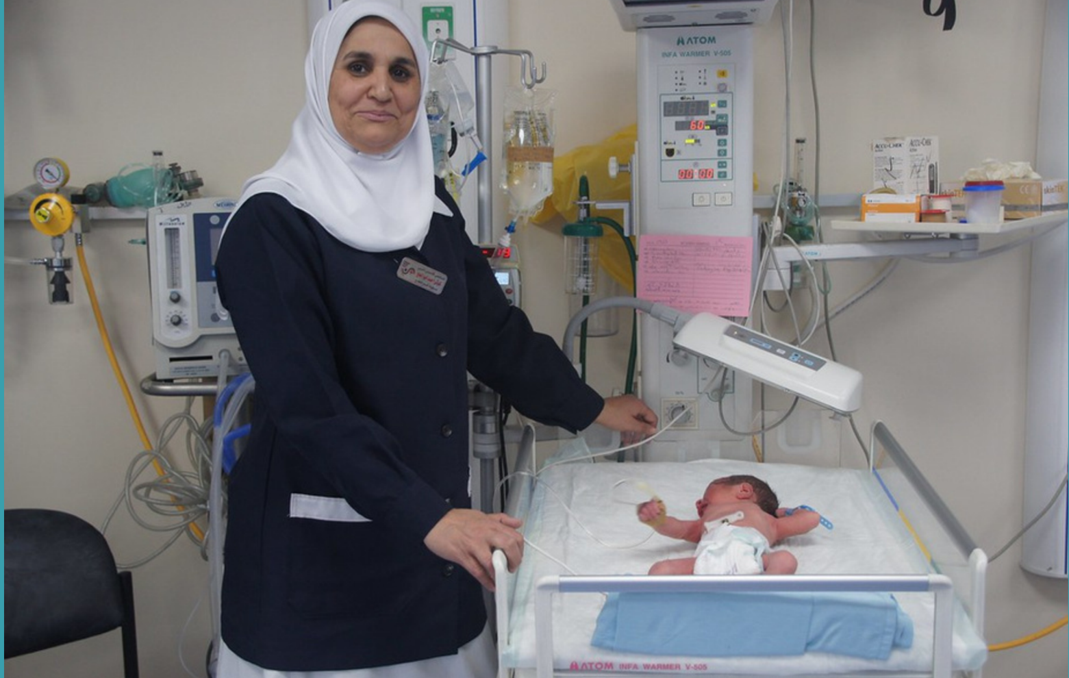
A nurse offering neonatal care at St. Luke's Hospital, Nablus