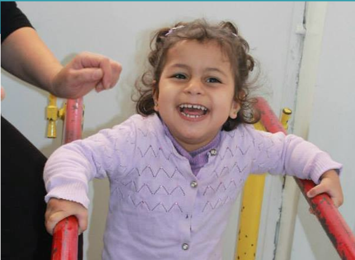
A child at the Jerusalem Princess Basma Centre