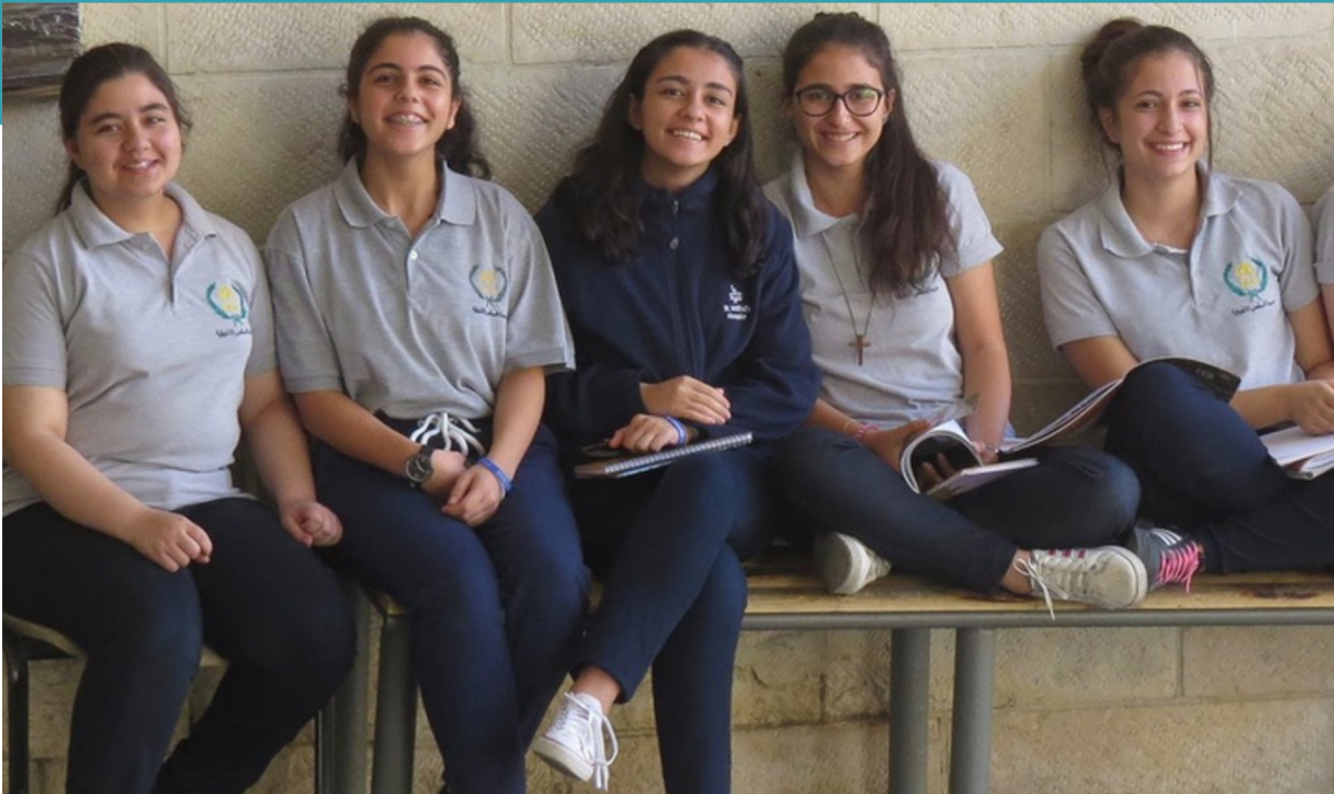
Juniors at The Saviour's School, Zarqa, Jordan